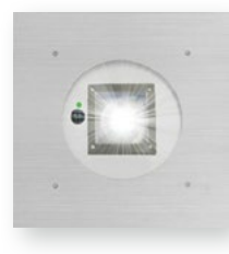
HELO F1 / F1-12 / F1-24

Helos can be integrated into your BACnet Building Automation System to enhance control and reporting and lower your total cost of ownership.